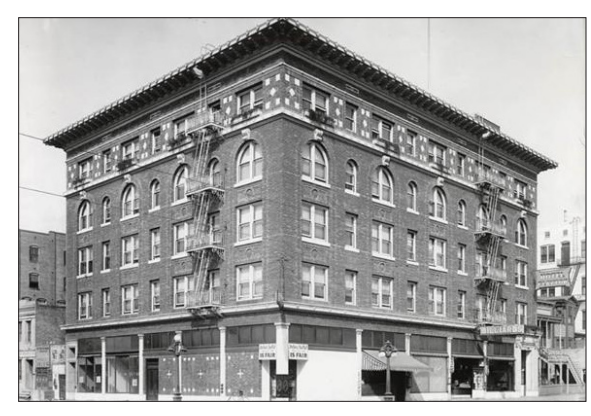
Marshall Hotel circa 1911.

For Phase 3, Farrell designed and installed no vibration, Auger Cast Pile (ACP) deep foundation support for the new 11-story concrete and steel hotel. The actual condition of the interior shoring of the brick walls