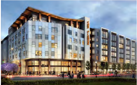
The Pierce San Jose, CA